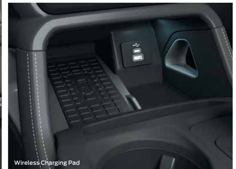
Wireless Charging Pad