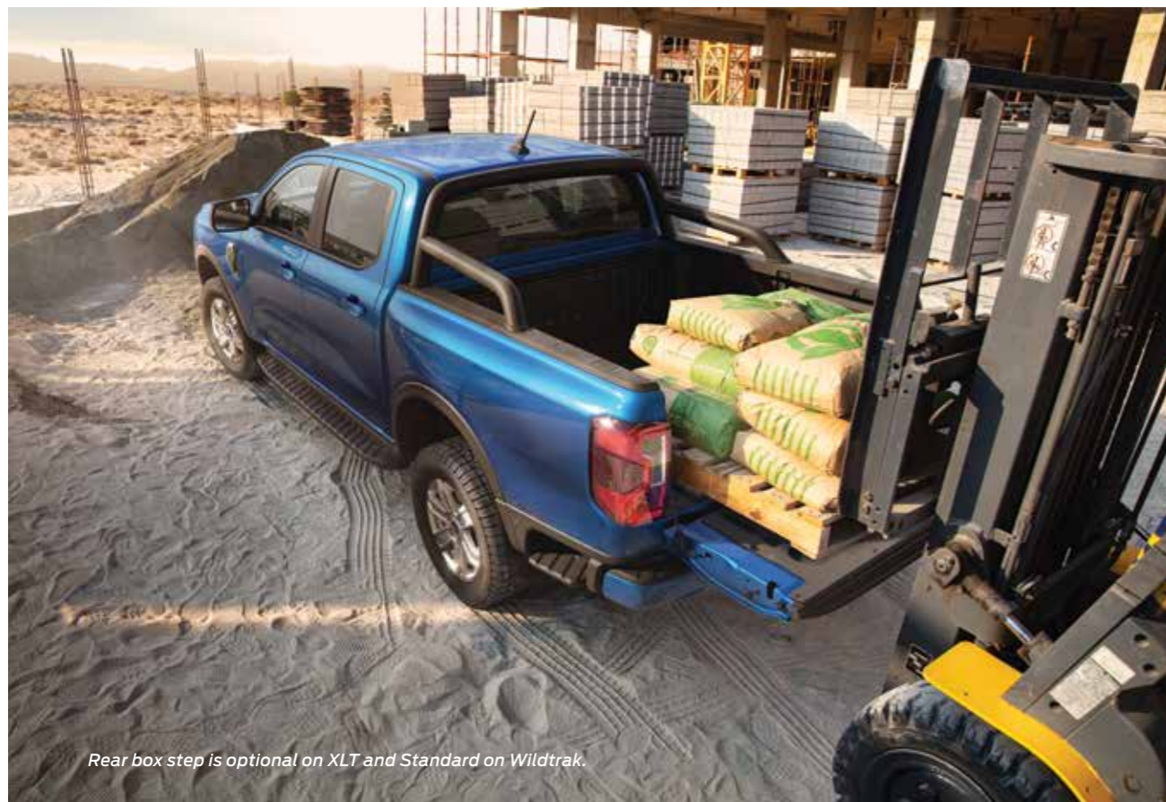
Rear box step is optional on XLT and Standard on Wildtrak.

On selected models, a network of lights including headlamps, external mirror puddle lamps and rear box lamps work together to illuminate the perimeter of the vehicle so you can work or play into the night.