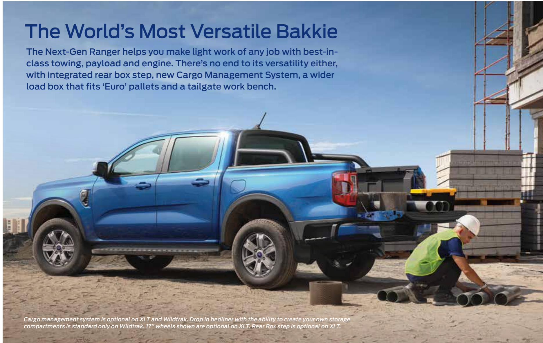
Cargo management system is optional on XLT and Wildtrak. Drop in bedliner with the ability to create your own storage compartments is standard only on Wildtrak. 17" wheels shown are optional on XLT. Rear Box step is optional on XLT.

The Next-Gen Ranger helps you make light work of any job with best-in-class towing, payload and engine. There's no end to its versatility either, with integrated rear box step, new Cargo Management System, a wider load box that fits 'Euro' pallets and a tailgate work bench.