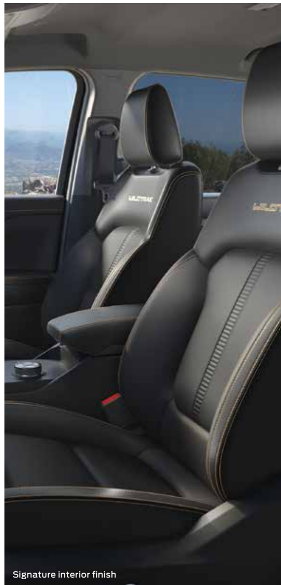
Signature interior finish